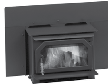
Performer™ C210 with Traditional Door