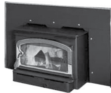
Performer™ C210 with Arch Door and Blower